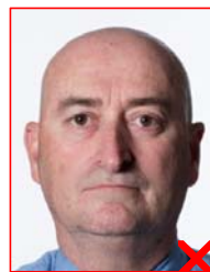
The face and background must be shadow-free