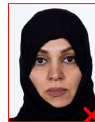
Head-coverings must not cover the face – same with hair